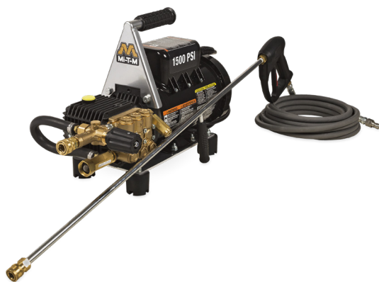
DC-1502-H0E1G (Hand Carry)

WARNING: Cancer and Reproductive Harm - www.P65Warnings.ca.gov .